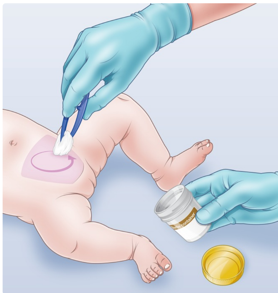
Fig 1 Quick-Wee voiding stimulation method of gentle cutaneous suprapubic stimulation using gauze soaked in cold fluid.